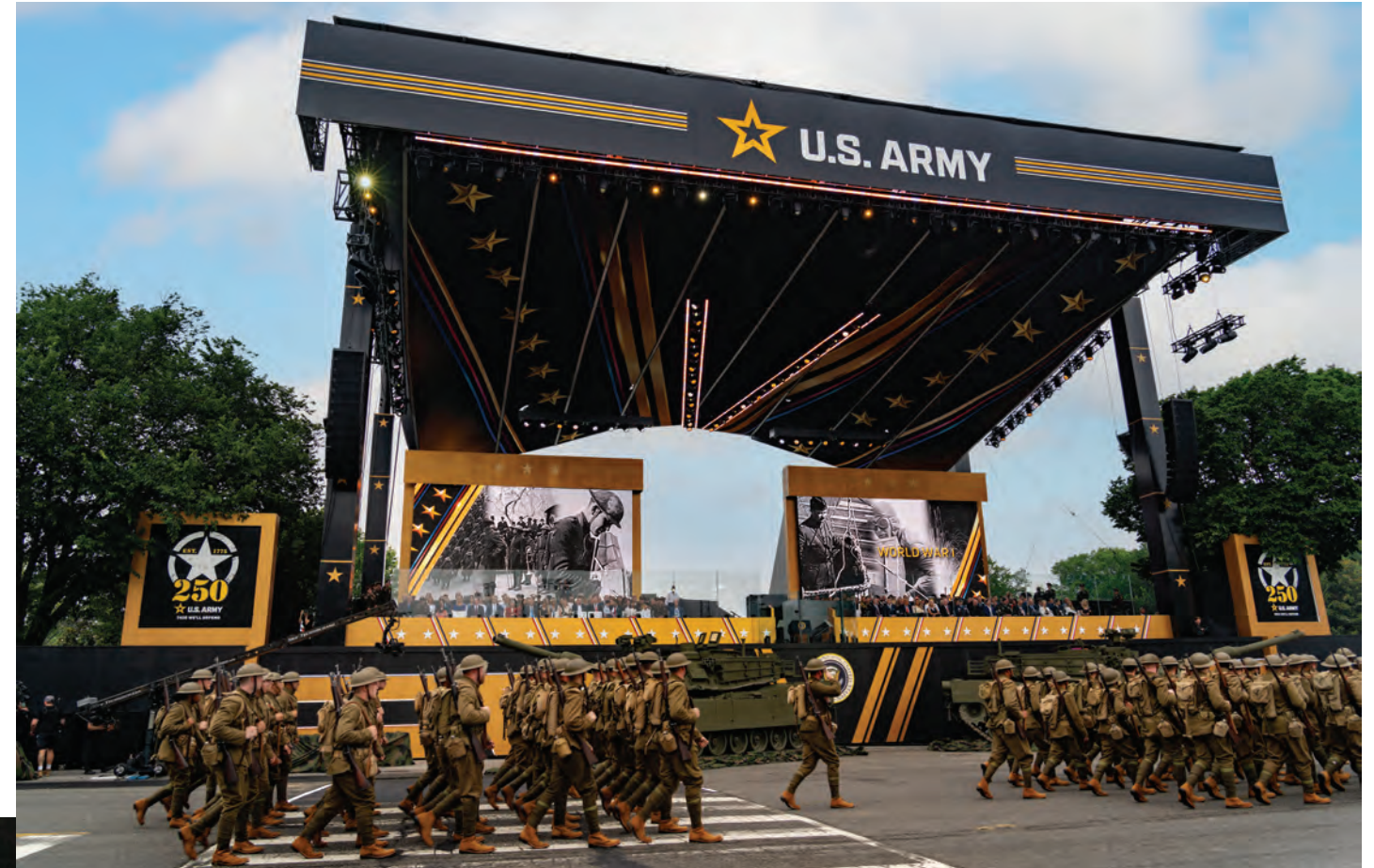
⤴ Above: The U.S. Army 250th Birthday celebration, June 14, 2025. Soldiers depicting WWI uniforms parade past the Commander in Chief.