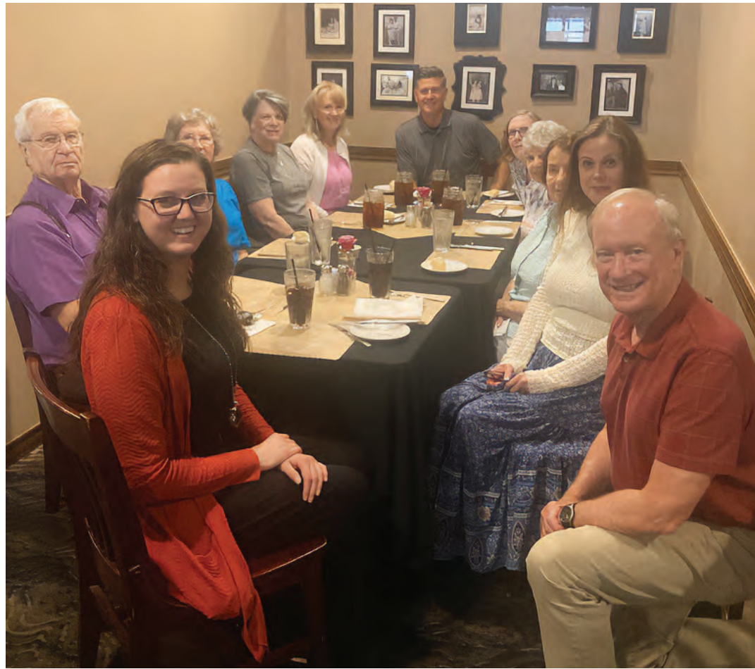
Left: Museum docents and staff at the Docent Appreciation Luncheon at the Beehive Restaurant.