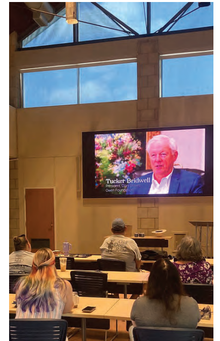
Above: Teachers attending the June workshop in the museum's Legacy Hall.