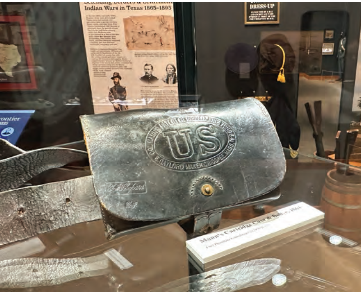
◀◀ Left: Artifacts in the Guardians of the Frontier exhibit.