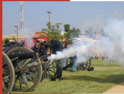
Cannons firing at the Spirit of the Frontier Festival in September