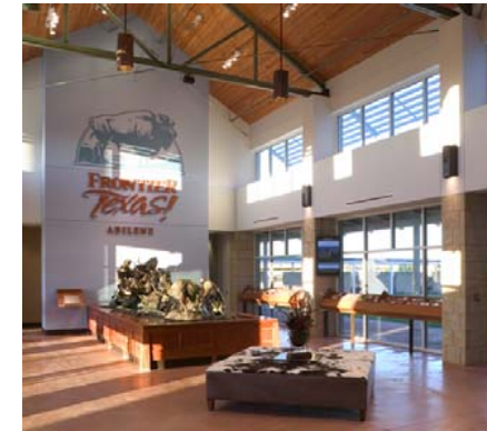
Visitor Center Lobby

the standard, bone-dry history exhibit. Instead, it teaches the region's history from 1780 to 1880