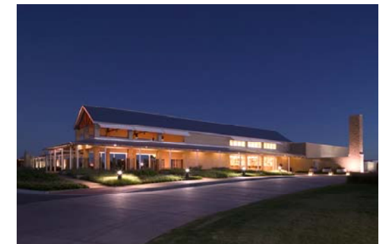
Frontier Texas! lighted at dusk looking east.

Thanks to the hard work of a number of local tourism promoters led by the Abilene Convention & Visitors Bureau, a glowing feature story on Abilene in Texas Highways Magazine said "Buffalo hunters, Comanche warriors, explorers, and pioneer women are reborn in an interactive, multimedia theater experience called the Century of Adventure. Unlike