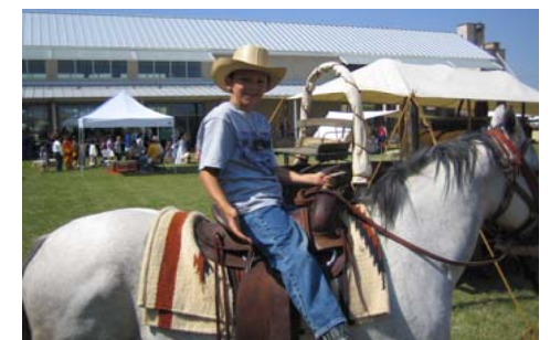
Members get free admission to special events!